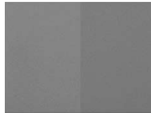
Unbalanced sensor with visible line