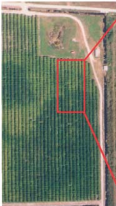
Figure 4. Aerial photo of citrus grove from 3,000 feet.