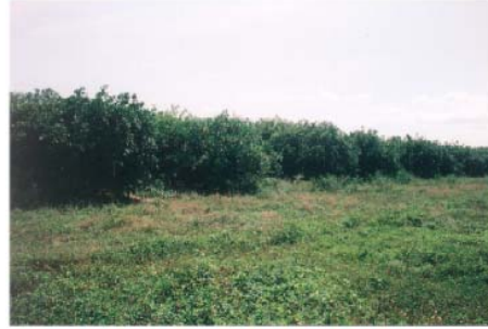
Figure 2. Ground view of a test site.