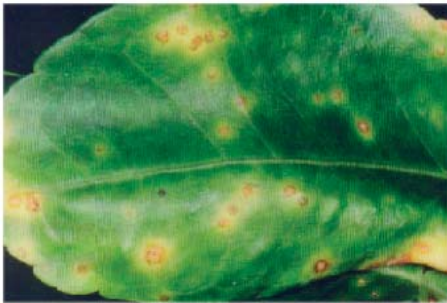
Figure 1. Leaf infected with citrus canker.