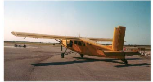
Figure 3. Aircraft used for citrus canker project.