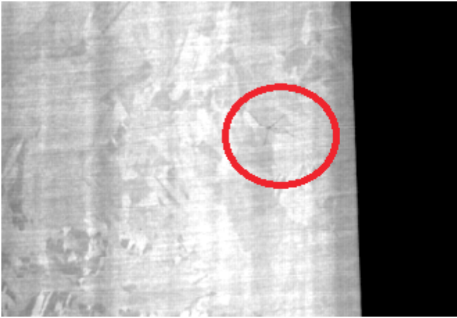
Fig. 3. SWIR imaging is able to detect very tiny cracks (circled) beneath the surface of a silicon wafer.

the line rate increases, the exposure time, and thus the number of photons reaching the detector during the exposure time, decreases. At a rate of 1,000 lines per second, for instance, the exposure time can be a maximum of 1 ms. Increasing the line rate shortens the exposure time even more, so it becomes crucial that the noise doesn't overwhelm the light signal collected by the detector. Of course, it is possible to increase the light intensity in the system so that more photons per second reach the detector, but that's not always easy; it drives the cost of the system up and can create problems with heat. For this reason, detectors with low noise levels are desirable.