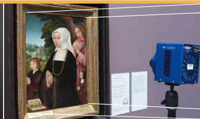
⌘ Art inspection