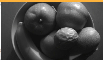
⌘ Food inspection